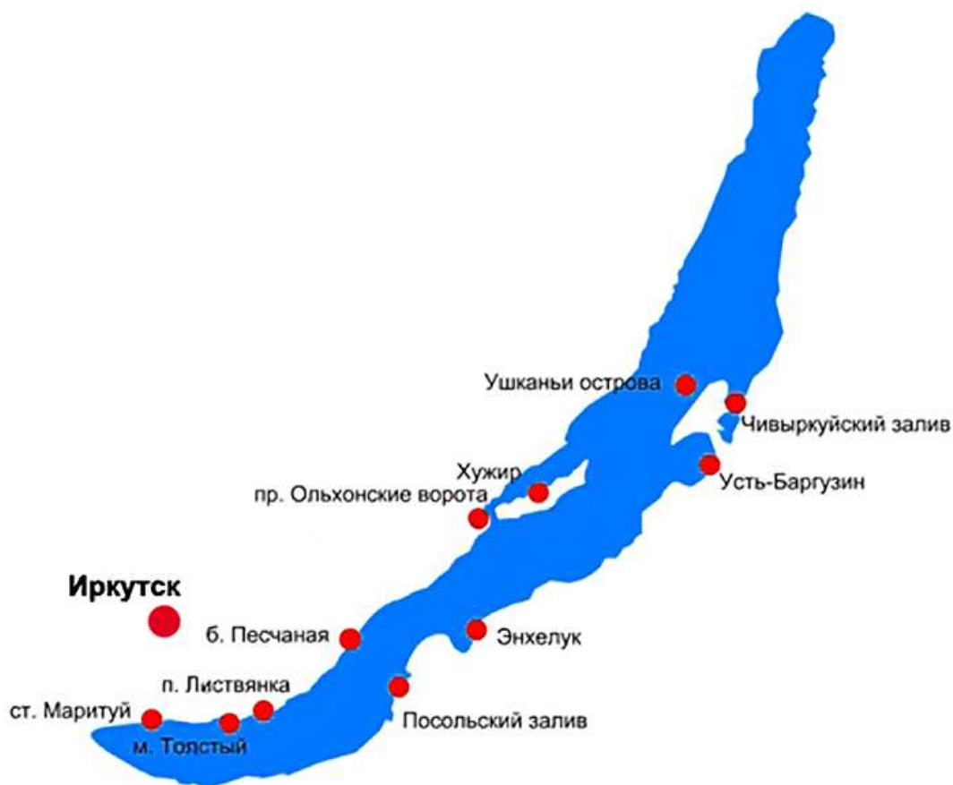
Figure 6 . Map of Lake Baikal .

The Baikal usually sunny weather. For example, during the year in the village of Bolshoye Goloustnoye is only 37 days it without the sun, and on the island of Olkhon - 48 days .