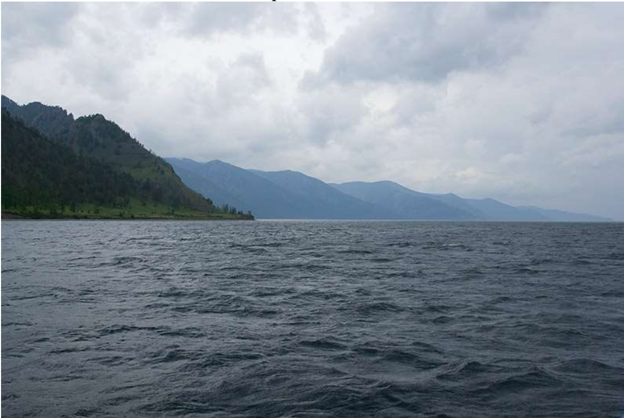
Figure 5 . Lake Baikal .

Lake Baikal is considered the largest natural tank of fresh water and the deepest lake on Earth with maximum depths of 1642 m.