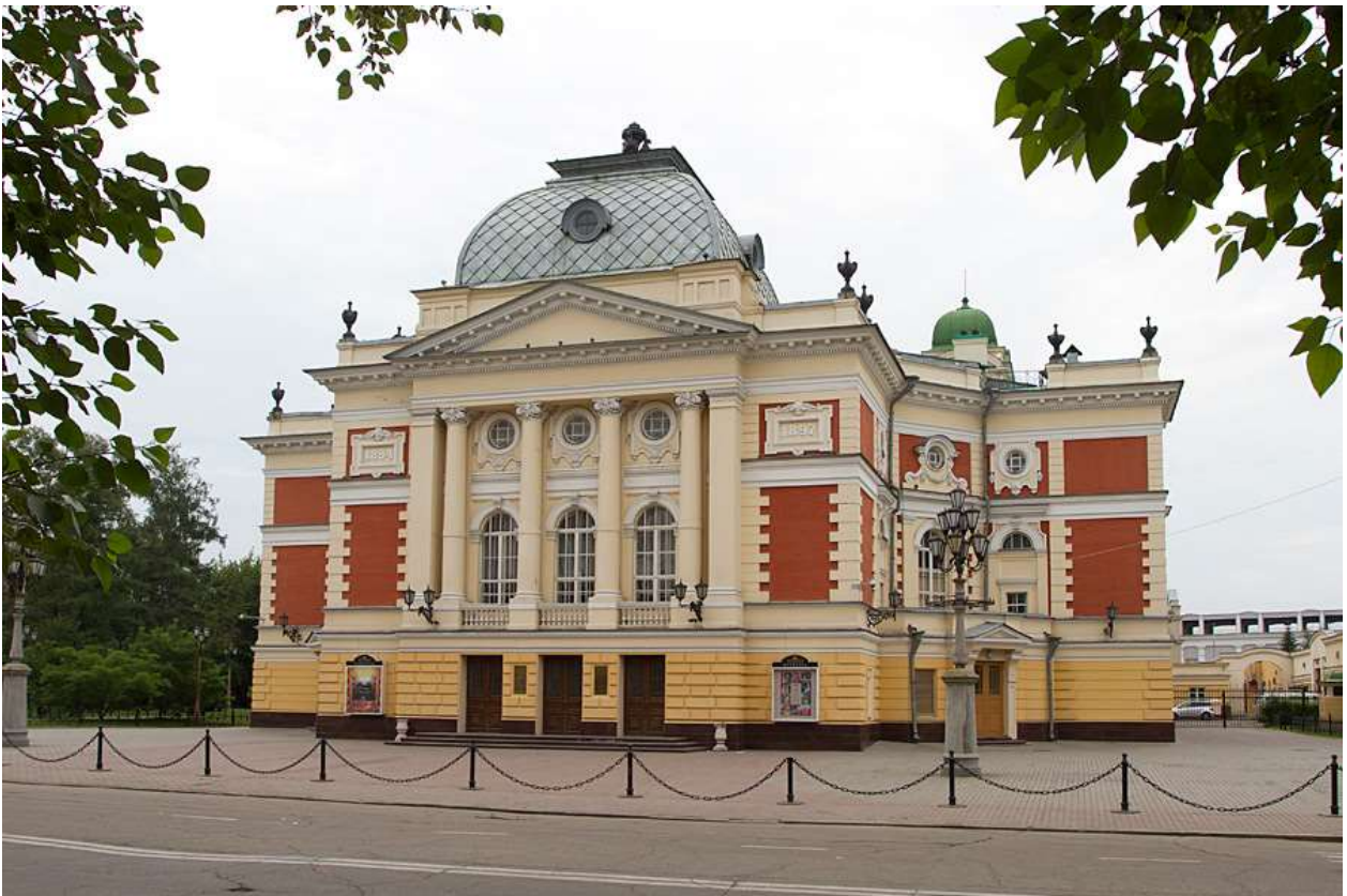
Figure 4 . Irkutsk Drama Theater. N.P.Ohlopkova (1897 architect V.A.Shreter).