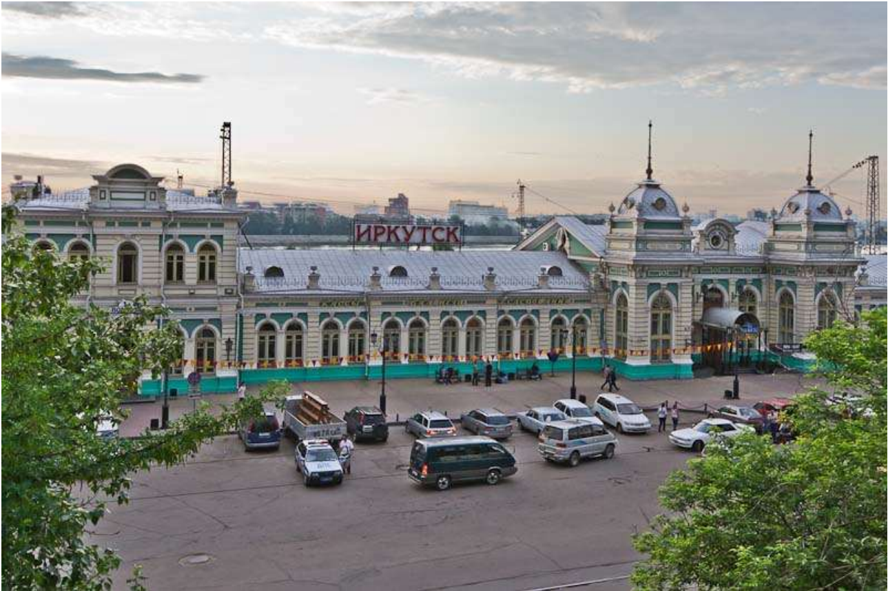
Figure 1. The railway station (architect V.I.Kolyanovsky 1907).

The city of Irkutsk is located at 70 km from Lake Baikal along the banks of the Angara and was named after the Irkut River, which flows into the Angara. On - apparently, the name of the river Irkut came from the tribes Yeni yrhu.