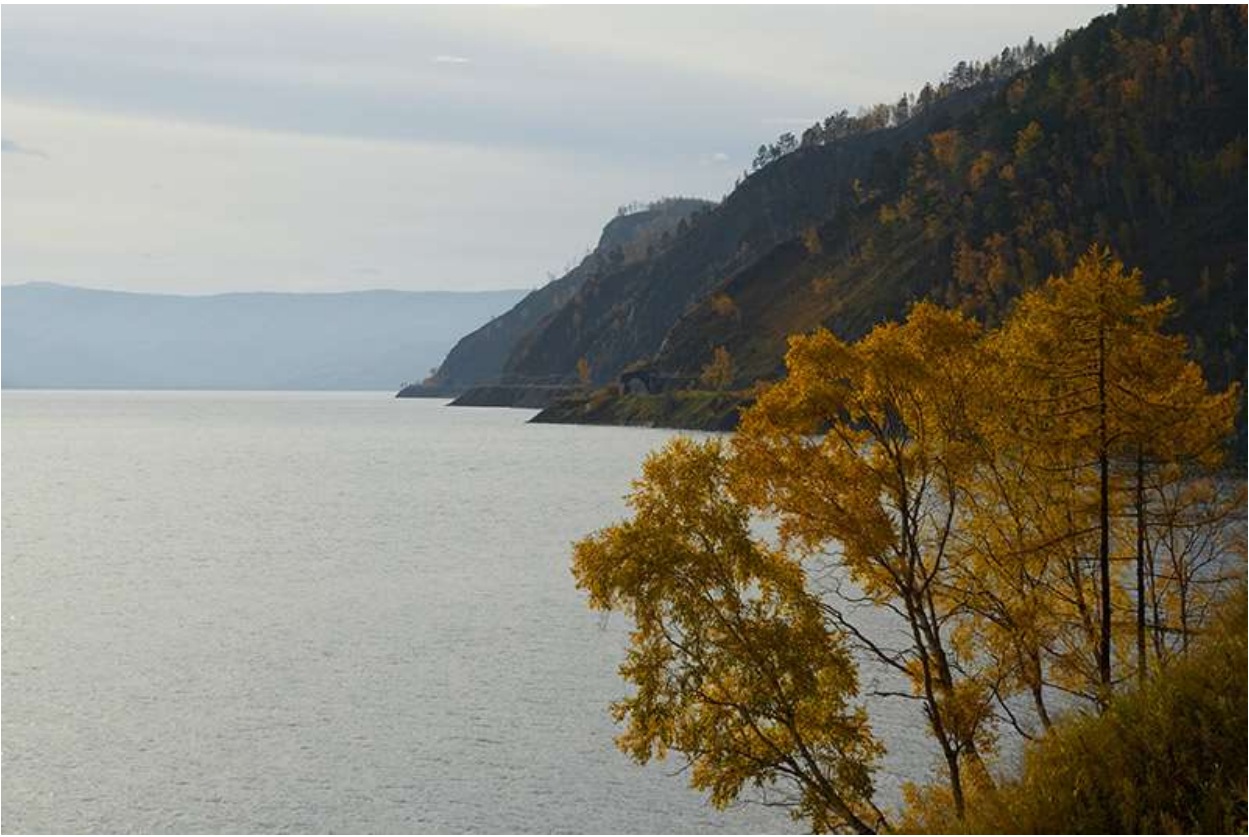
Figure 8 . Lake Baikal .

To get to the lake from the regional center is easiest by taxi or bus, which run from the bus station in Listvyanka is located in 70 km from Irkutsk on the shore of the lake near the source of the Angara.