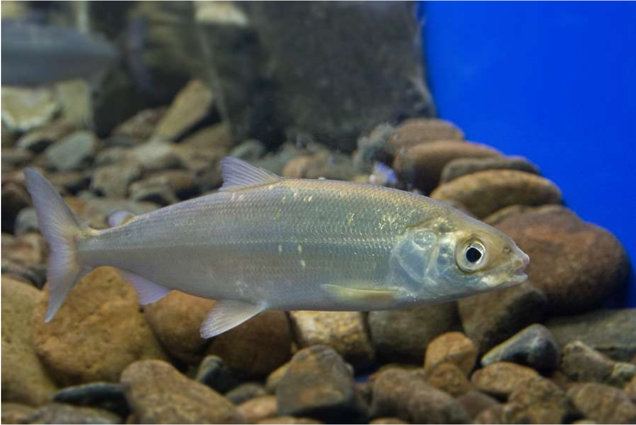
Figure 7 . Baikal omul.

the decision of the Russian Government dated 13 January 2010 abolished the ban on "the production of pulp, paper, paperboard and articles thereof without ICs use of closed water systems for industrial needs ".