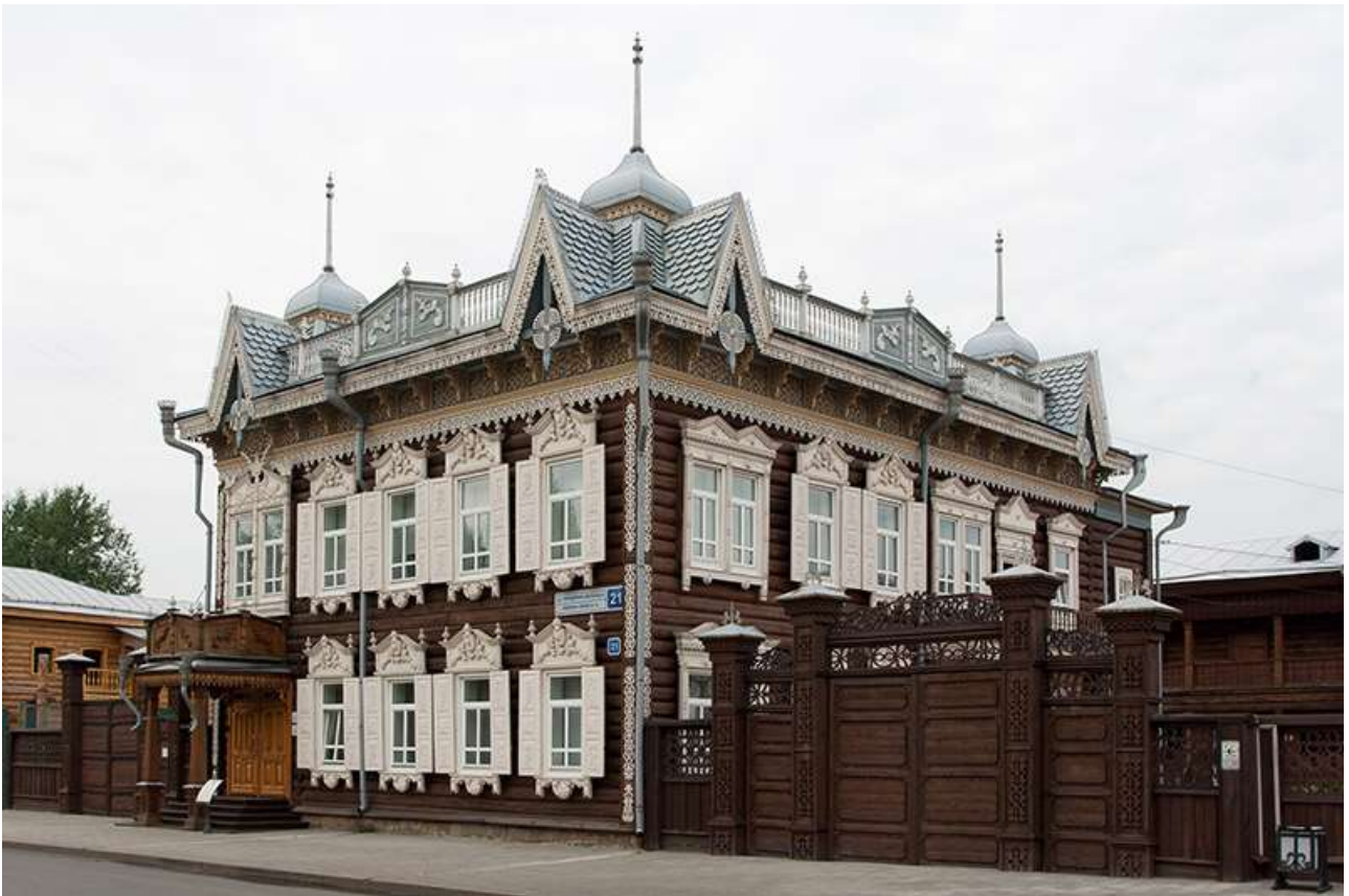
Figure 3 . House merchants Shastins (1907 g OD ).